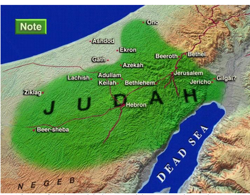
This map from https://slideplayer.com/slide/10933061/ by Heather Green.